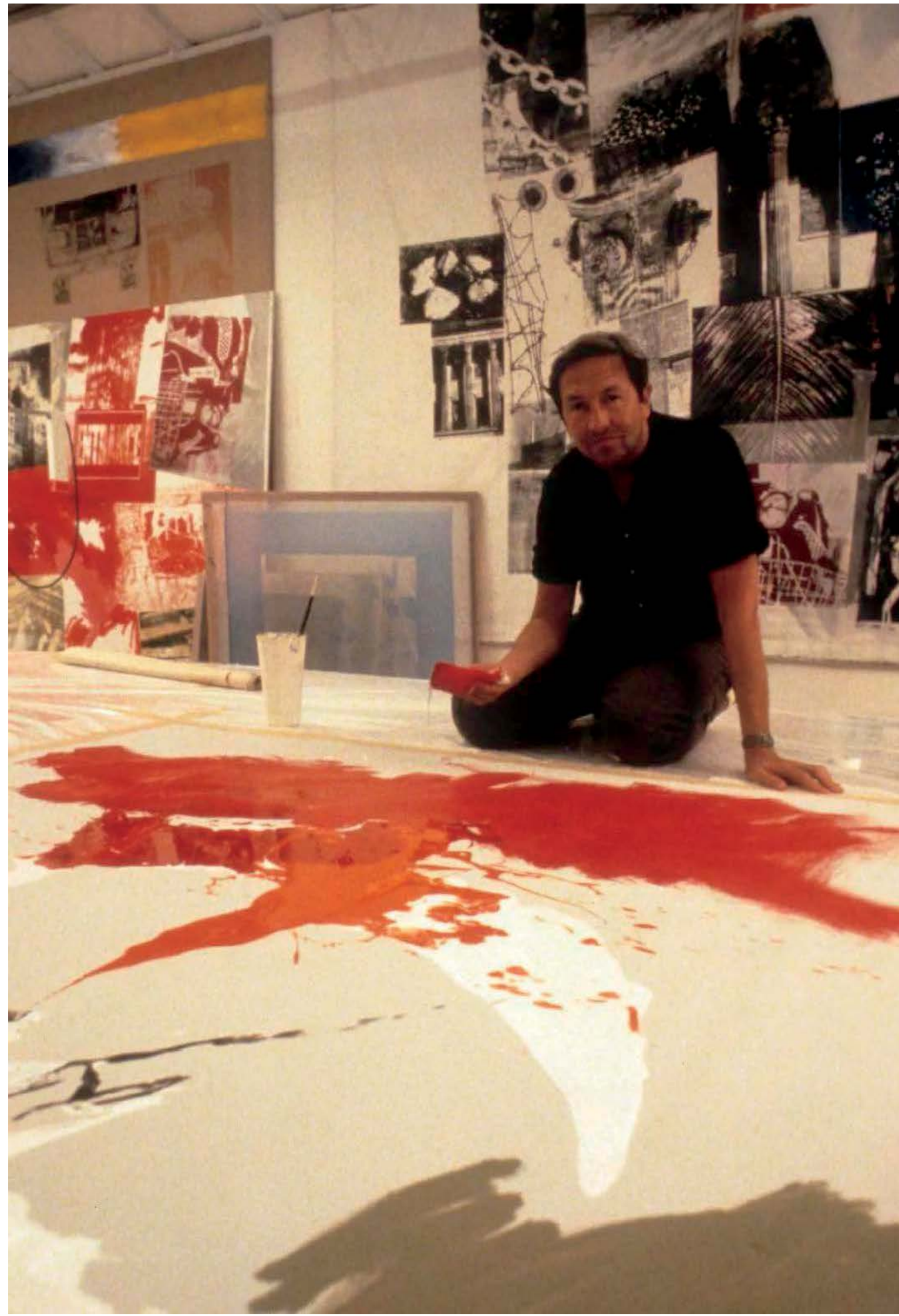
Rauschenberg working on Wall Rites (Salvage) in his Laika Lane studio, Captiva, Florida, 1984