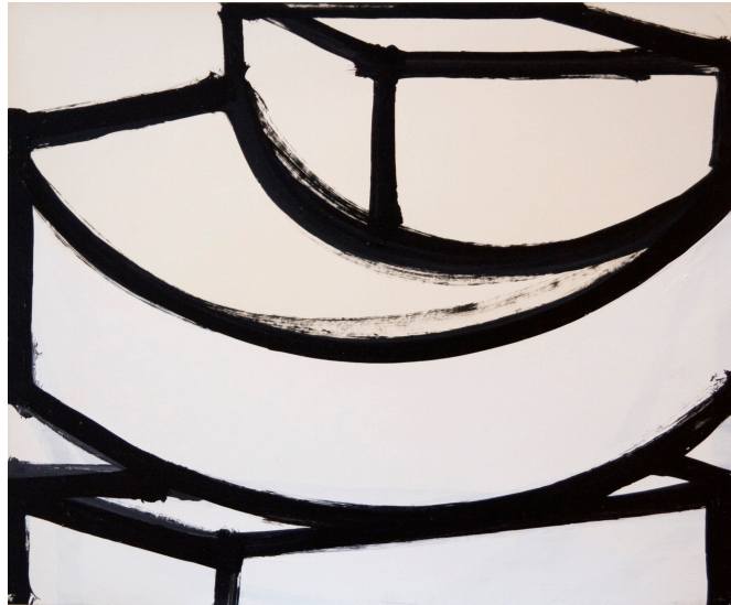
Al Held, Untitled, 1967, 20 1/2 x 24 3/4 Inches