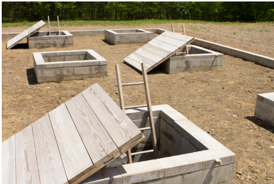
Alice Aycock: A Simple Network of Underground Wells and Tunnels , 2012, concrete block, wood, earth, approx. 28' wide x 50' long x 9' deep, Far Hills, New Jersey.

Opening Reception May 31 st 6-8 PM Exhibition runs through June 27 th