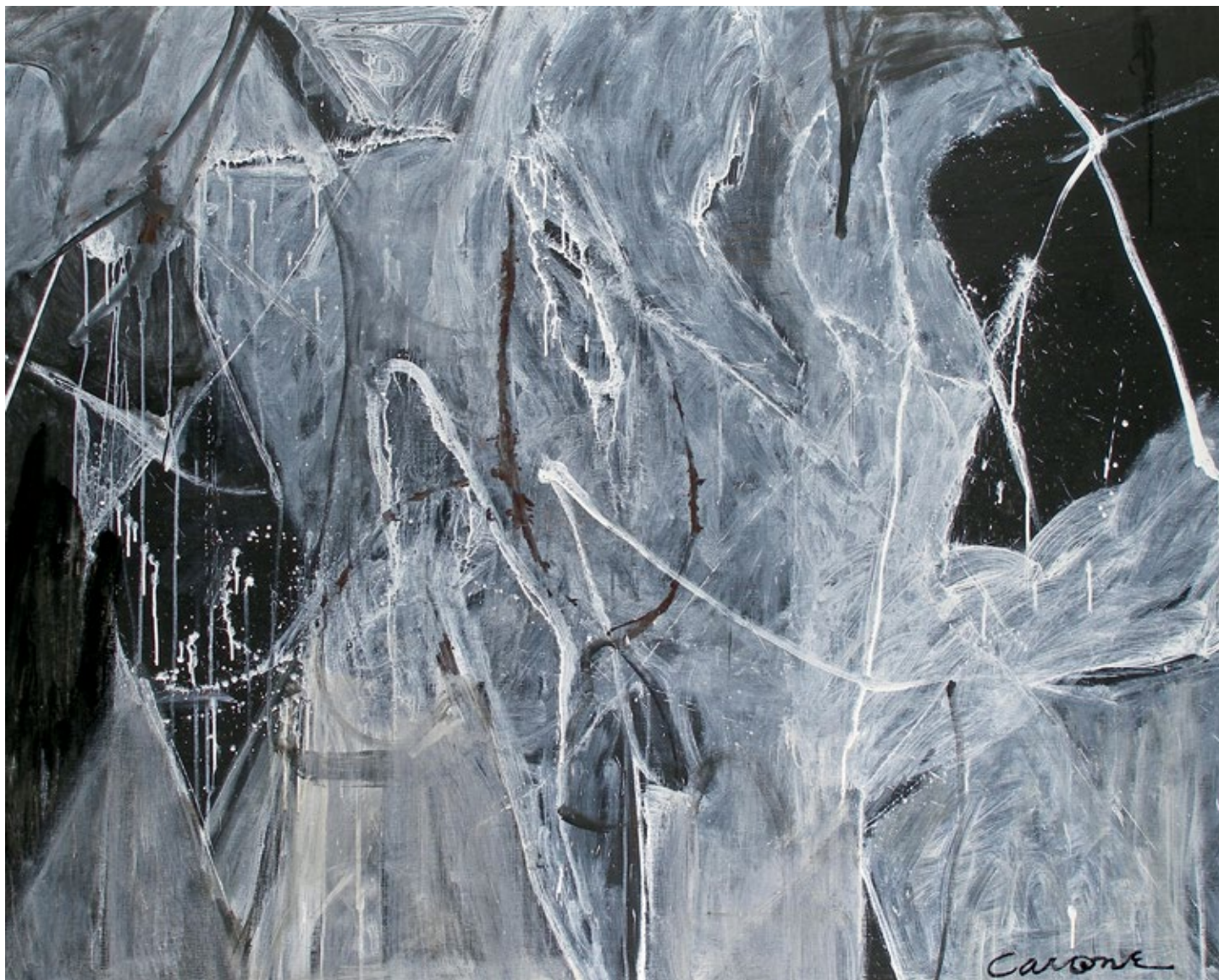
High Wire, 2008 Acrylic on tarpaulin, 48 x 60 inches

opposite page: Social Phobia, 2009 Acrylic on canvas, 75 x 95 inches