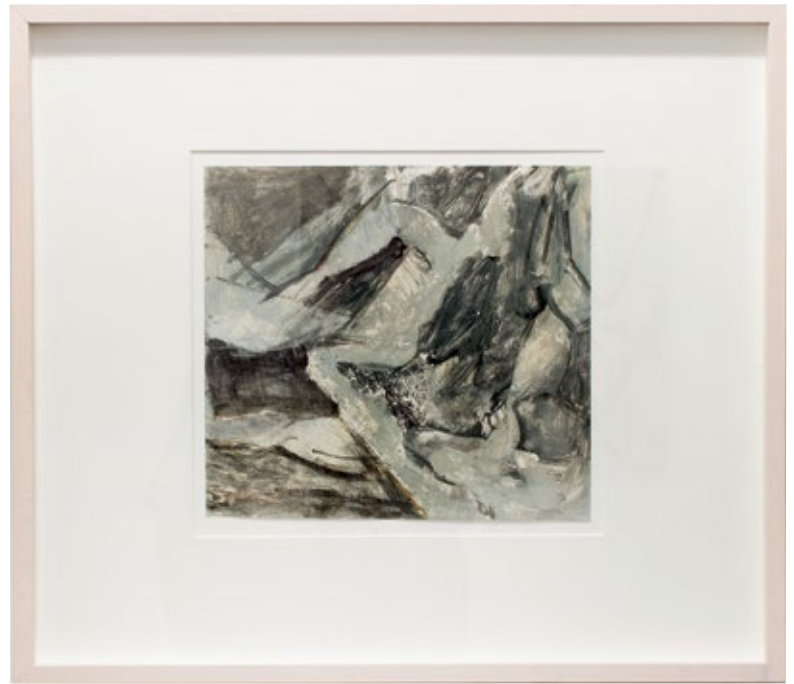
Untitled, 2006 Acrylic on paper 11 x 12 inches