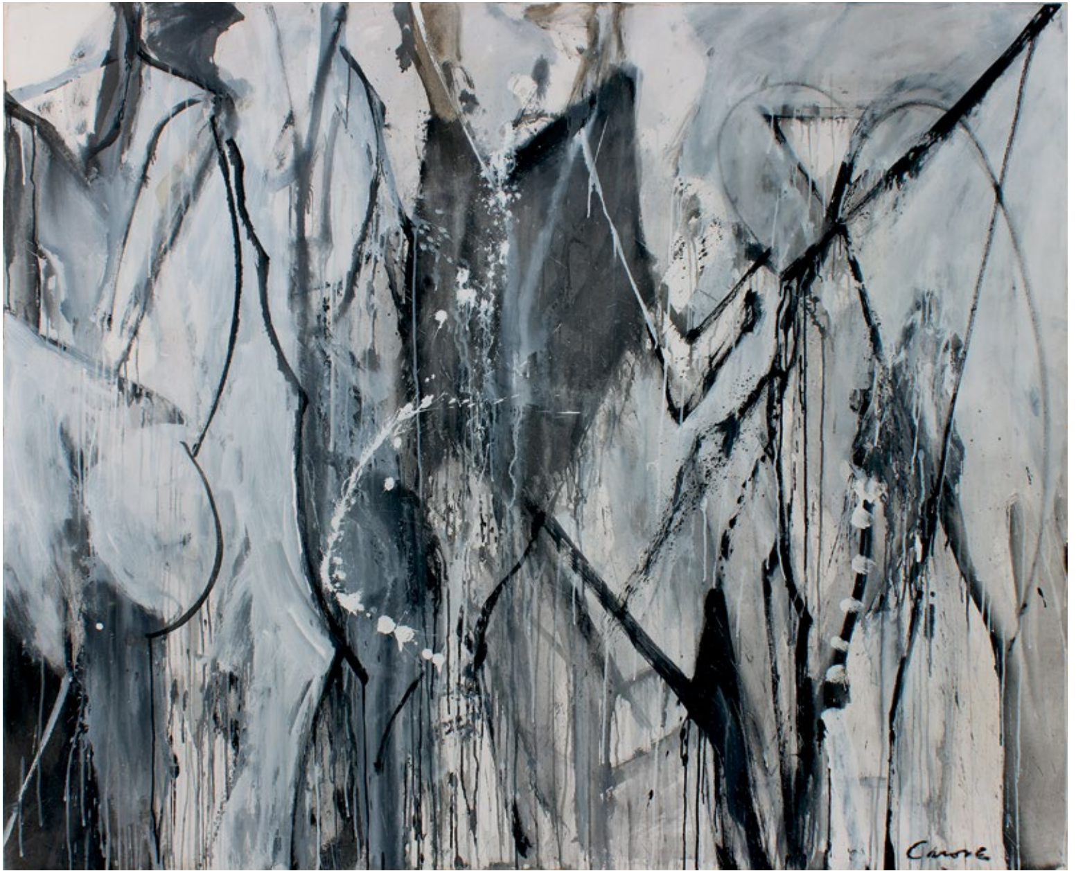
Cadenza, 2008 Acrylic on canvas, 58 x 71 inches