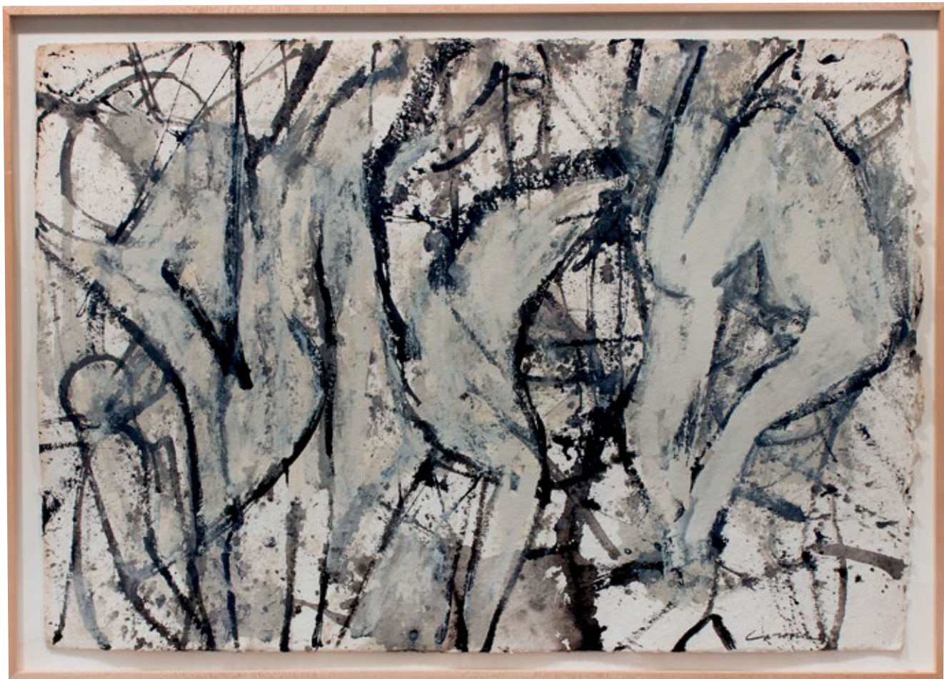
Untitled, 2008 Acrylic on paper 27 1/2 x 38 inches