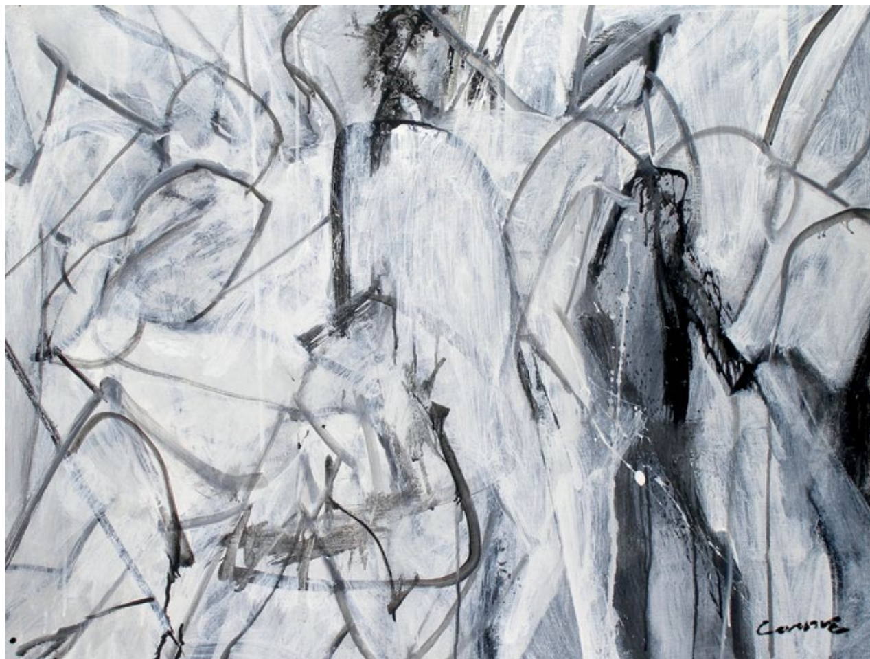
High Spirit, 2008 Acrylic on tarpaulin, 30 x 40 inches