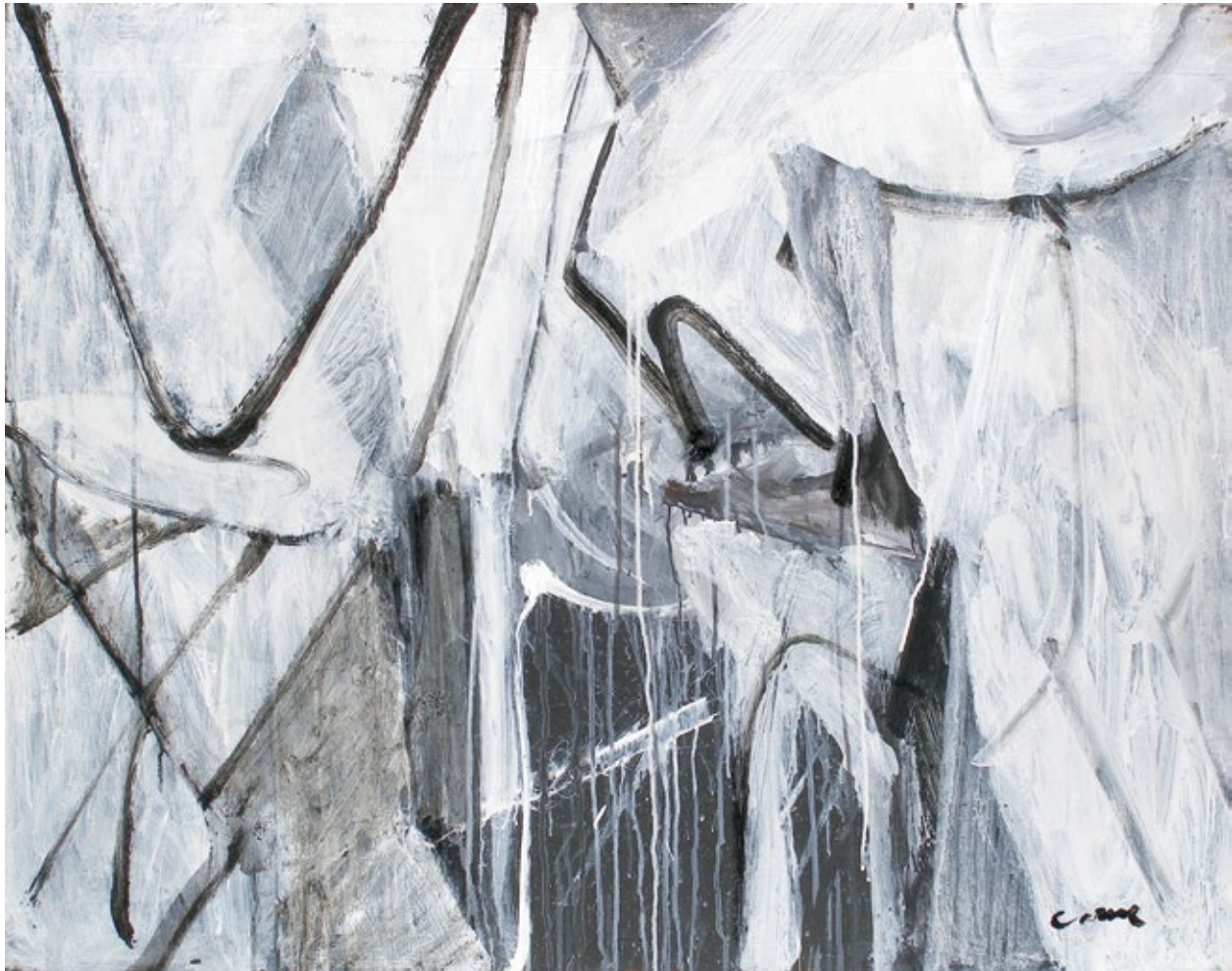
Off The Chart, 2009 Acrylic on tarpaulin, 33 x 42 inches