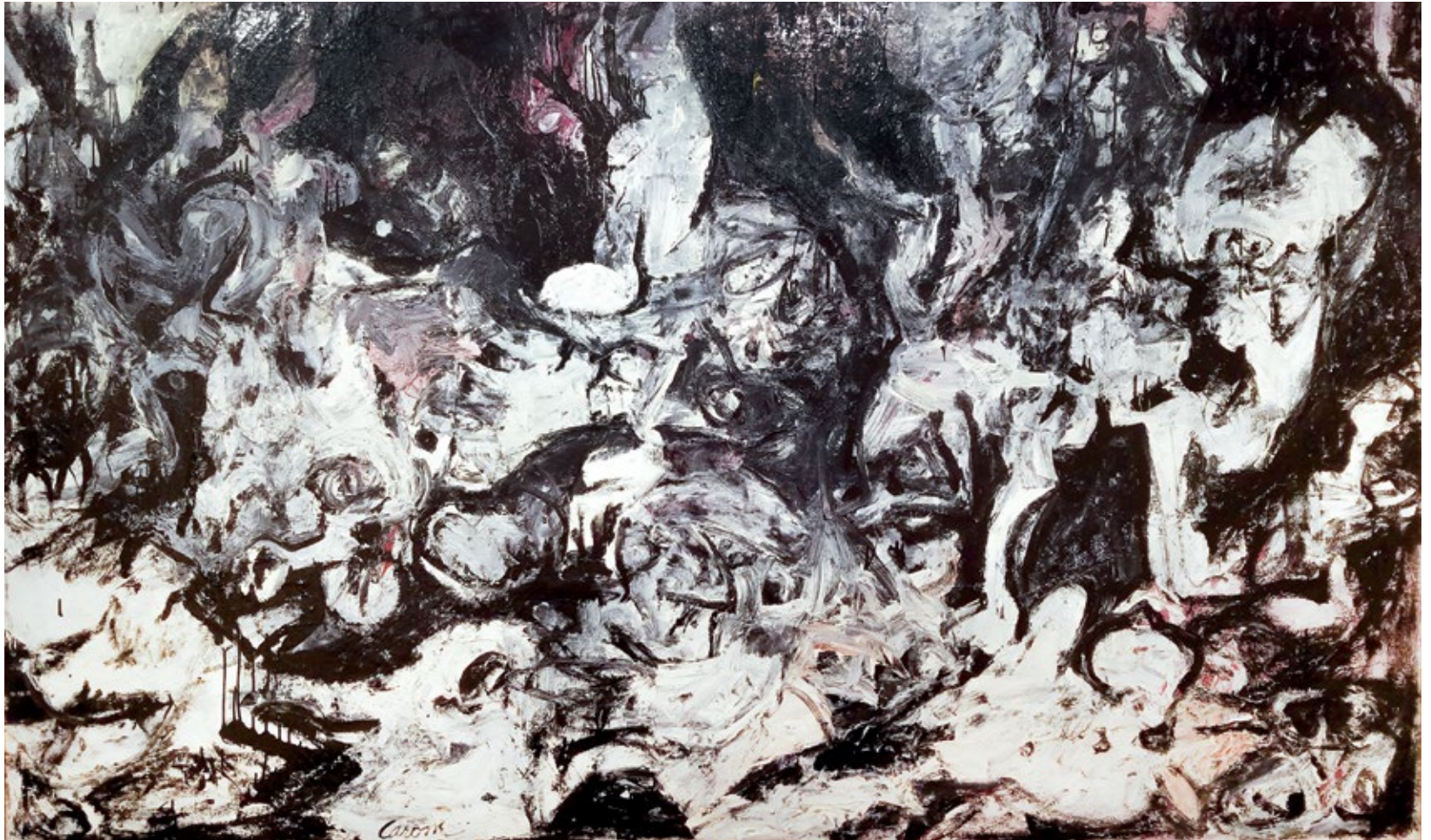
Untitled, 1958 Oil on linen, 55 x 92 1/2 inches (P-2524-S)