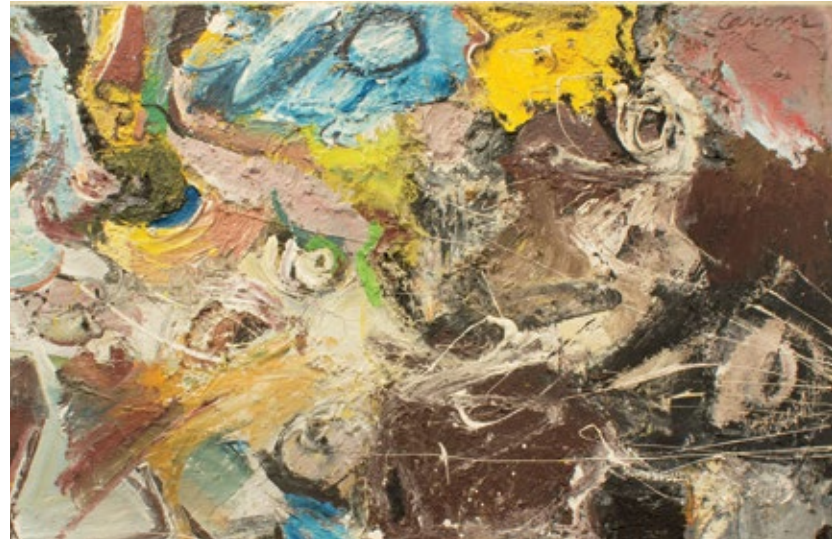
Untitled, 1953 Oil on board, 26 x 40 inches