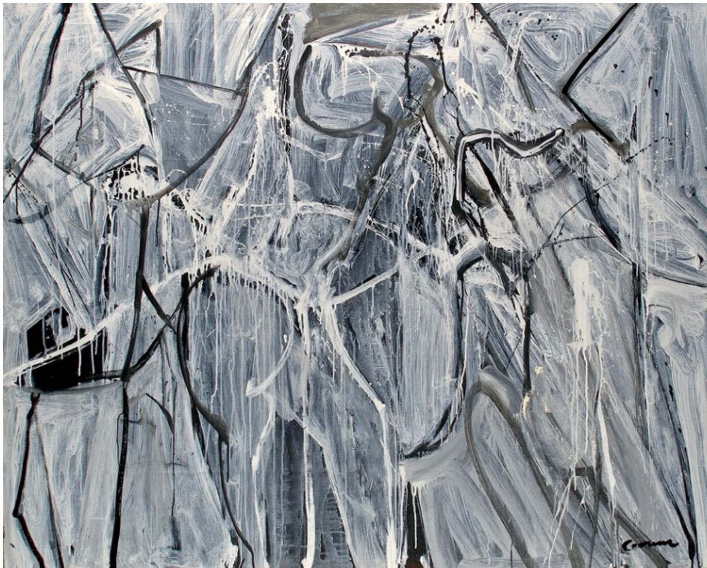
War Games, 2008