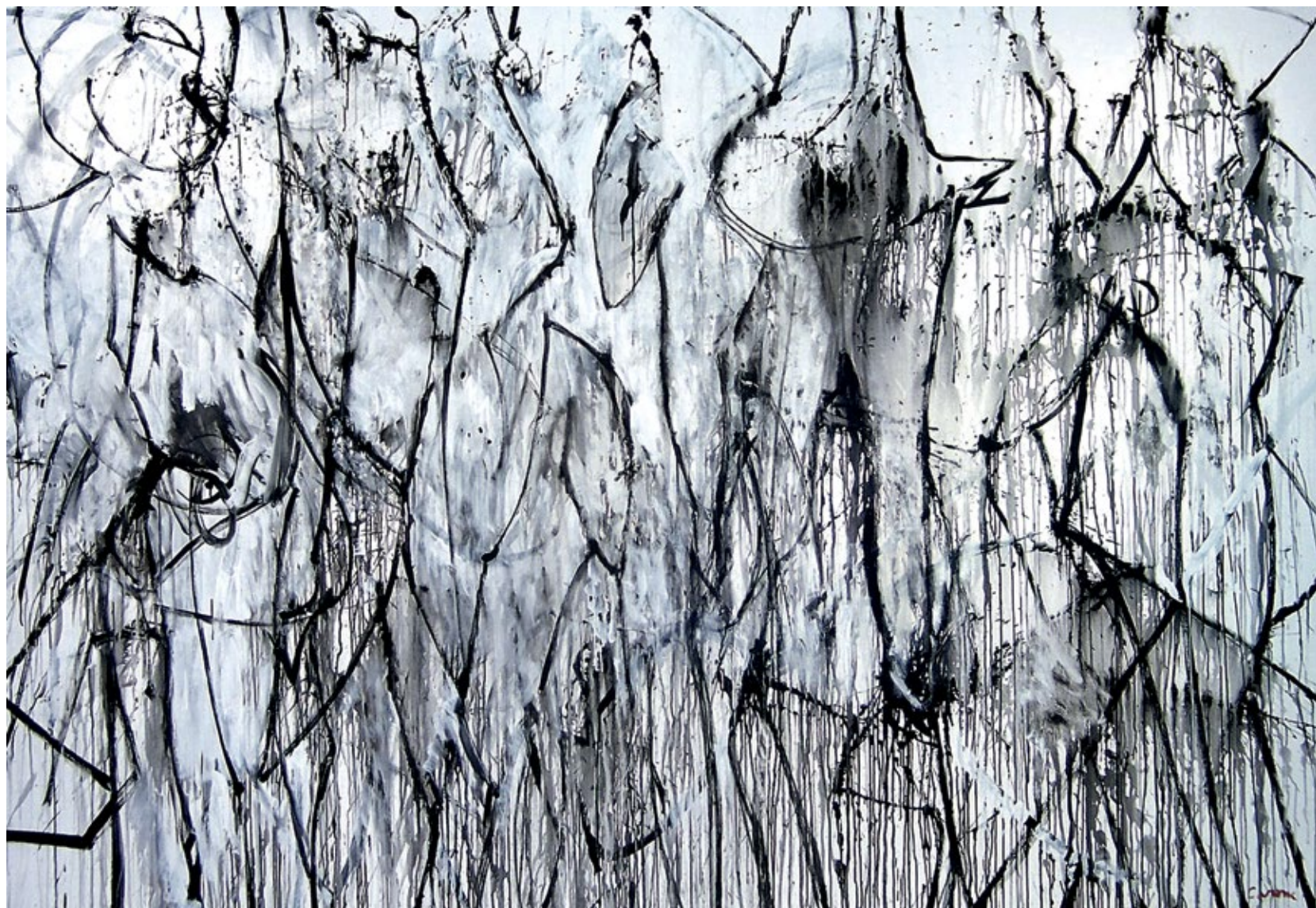
Lost Tribe, 2007 Acrylic on canvas, 84 x 119 1/2 inches