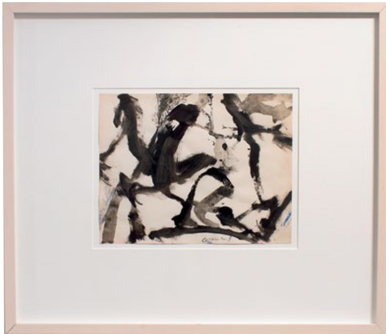
Untitled, 2008 Acrylic on paper 8 1/2 x 11 inches