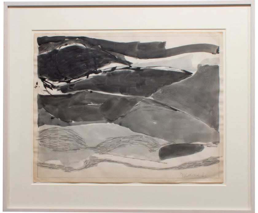
Maine #35, 1965 Ink on paper 19 x 24 inches