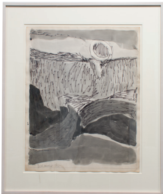
Maine #33, 1965 Ink on paper 24 x 19 inches

and painter William Blake, who's own ambition was to render the contemplation of nature as a transformative experience. This belief in the magical properties of nature stems from a lifelong fascination with Native American life and culture. He grew up reading his fathers collection of National Geographic Magazines with wide-eyed admiration. His first trip through the Rockies in 1948 was highlighted by an encounter with the Hopi and Navajo cultures. His reverence for these cultures, re-ignited during the 1960s, coincided with a broader cultural shift, as artists and intellectuals across the Western world began to look for cultural reference points outside