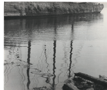
Wiscasset, Maine.