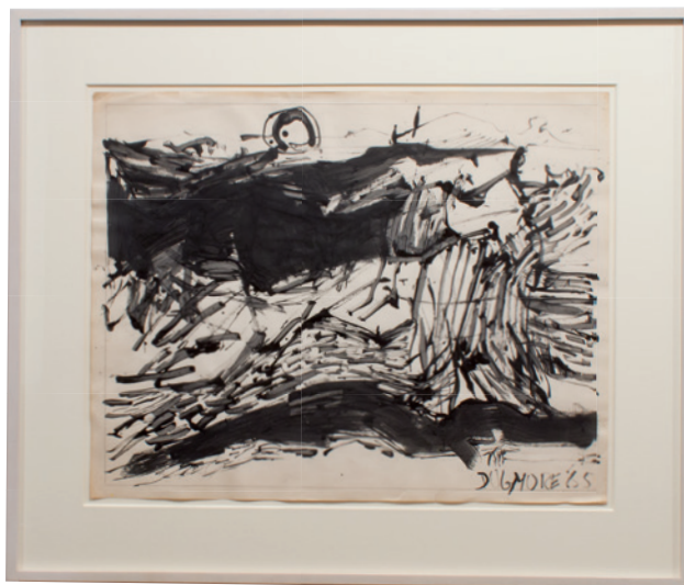
Maine #34, 1965 Ink on paper 19 x 24 inches