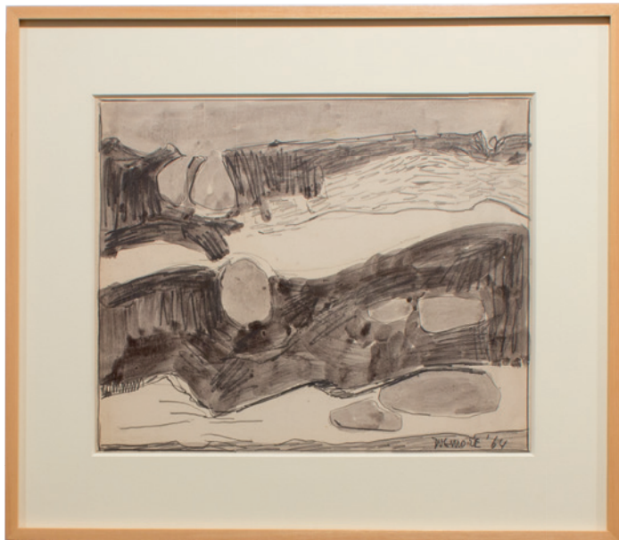
Untitled, 1964 Watercolor and pencil on paper 14 x 16 \frac{3}{4} inches