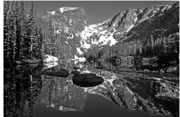
Hallet Peak, Rocky Mountain National Park