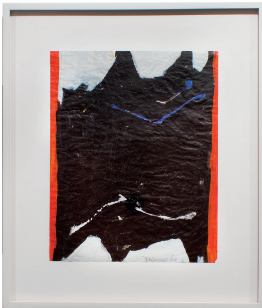
Untitled #12, 1968 Acrylic on paper 15 3 / 4 x 12 1 / 2 inches