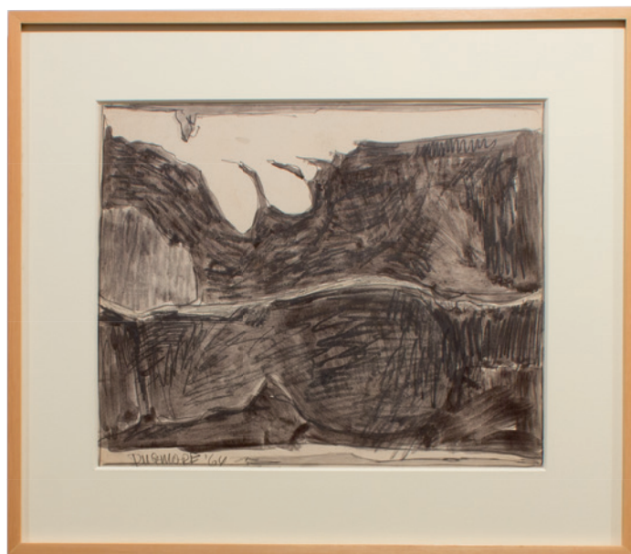
Untitled, 1964 Watercolor and pencil on paper 14 x 16 3 / 4 inches