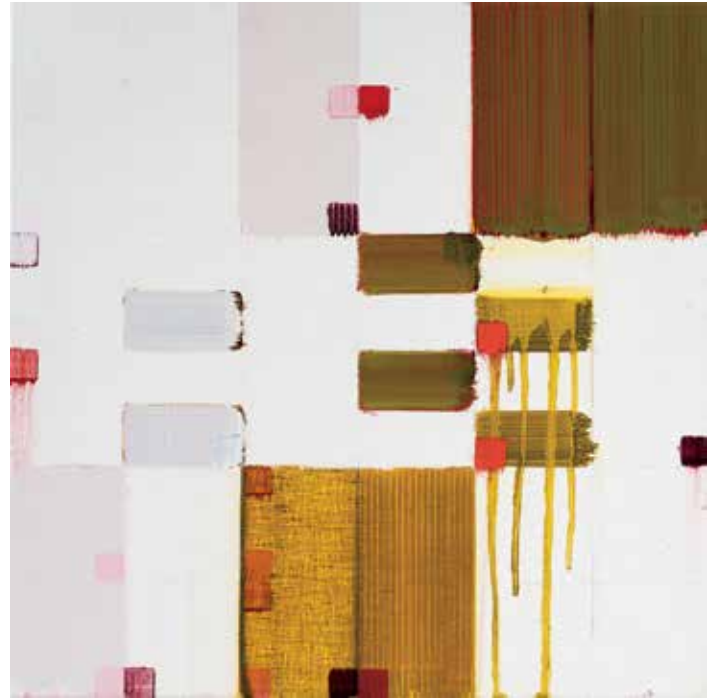
Untitled (18) , 2018 Oil on canvas 12 x 12 inches 30 x 30 cm