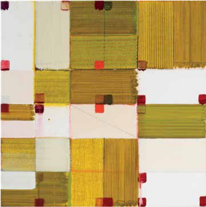
Untitled (8) , 2018 Oil on canvas 12 x 12 inches 30 x 30 cm