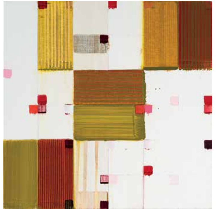
Untitled (15) , 2018 Oil on canvas 12 x 12 inches 30 x 30 cm