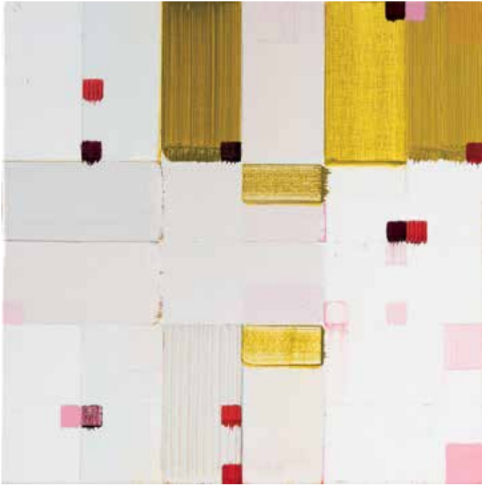
Untitled (14) , 2018 Oil on canvas 12 x 12 inches 30 x 30 cm