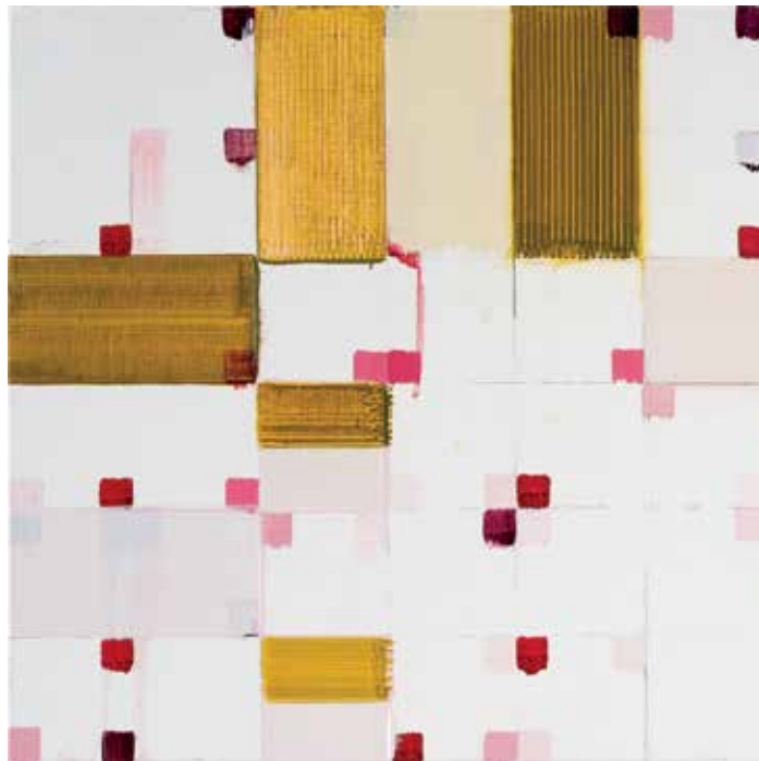
Untitled (17), 2018 Oil on canvas 12 x 12 inches 30 x 30 cm