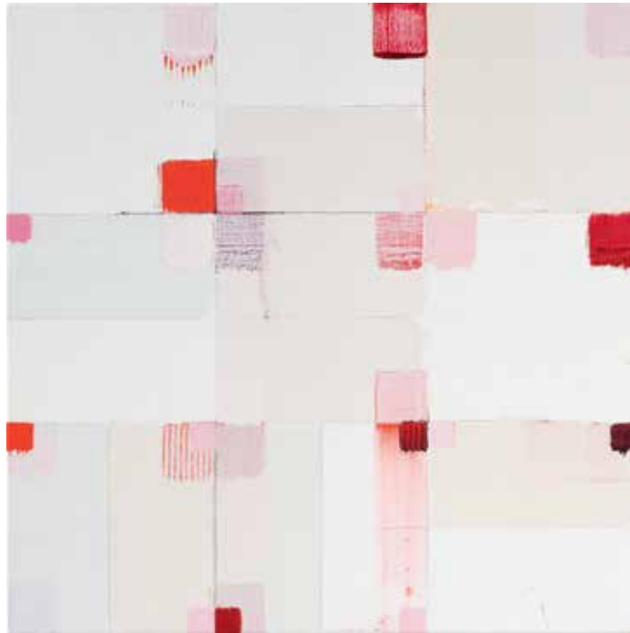
Untitled (12), 2018 Oil on canvas 12 x 12 inches 30 x 30 cm