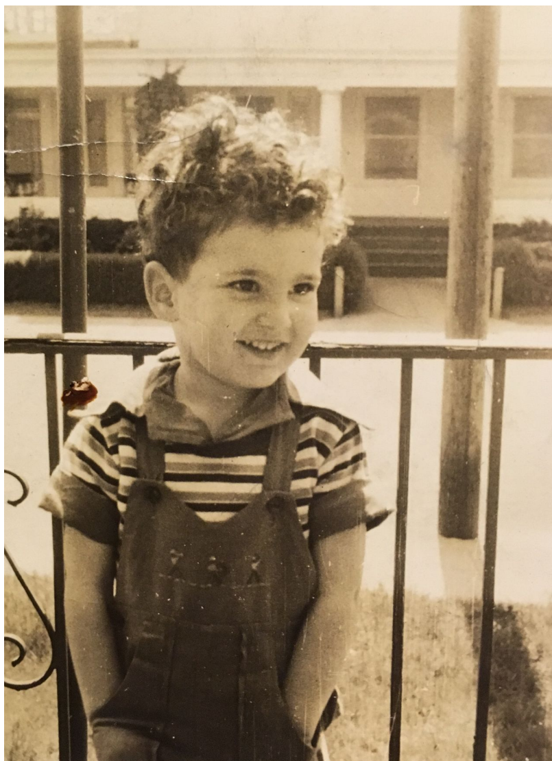
Larry Poons at age 3 in Far Rockaway, Queens.